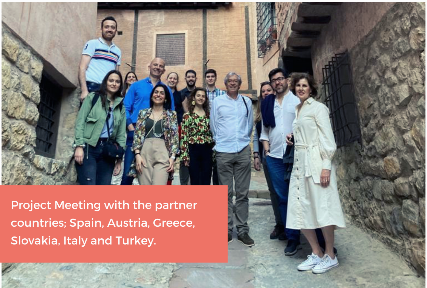
Project Meeting with the partner countries; Spain, Austria, Greece, Slovakia, Italy and Turkey.

After each partner made their presentations, the tasks were shared by making a joint decision. The partners left the meeting satisfied to discuss at the next meeting.